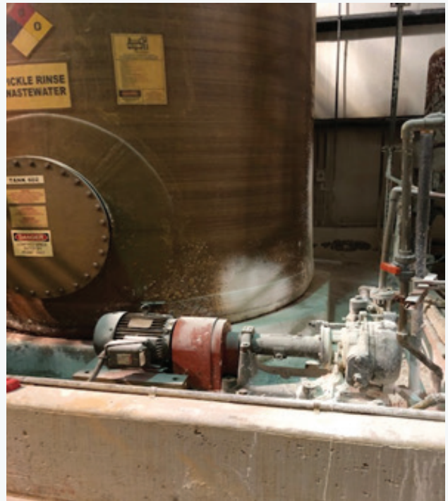
Model 1” Kpro